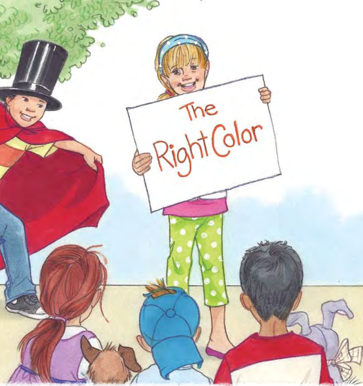
The first trick is "The Right Color."