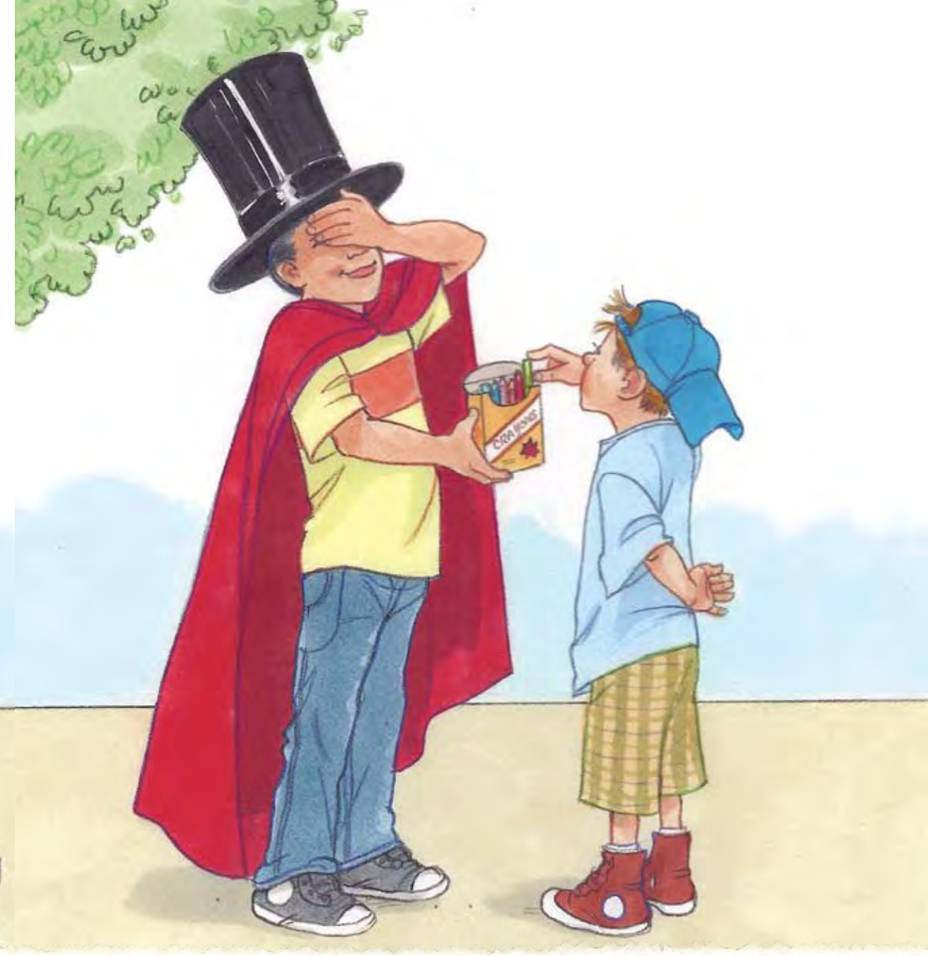
A friend takes a crayon from a box.