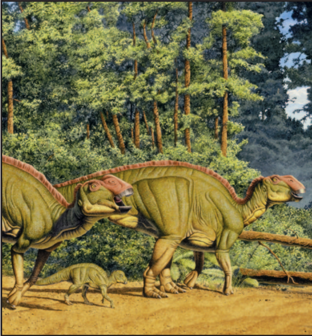
Kritosaurus (KRIT-o-SORE-us) Family