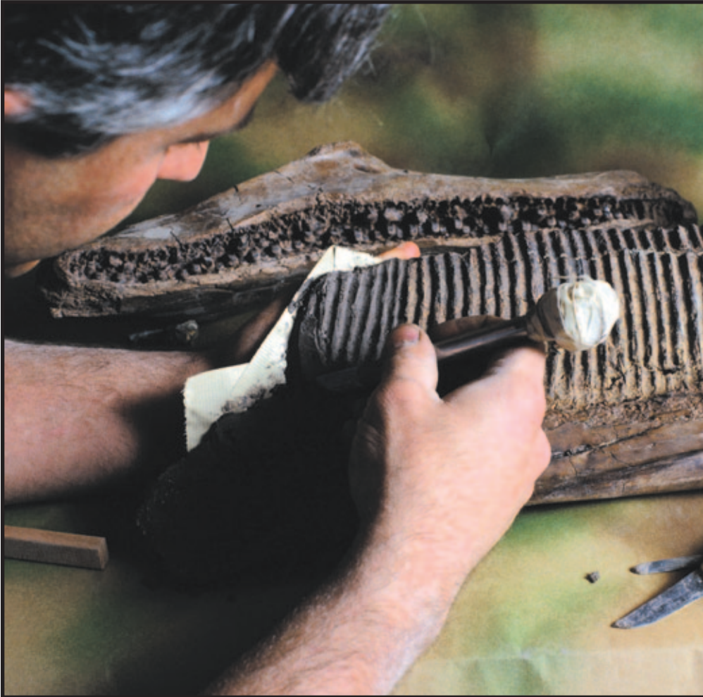
Paleontologist with duck-billed dinosaur jaw

☺ The scientists who study dinosaurs are called paleontologists (PAY-lee-on-TOL-a-jists).