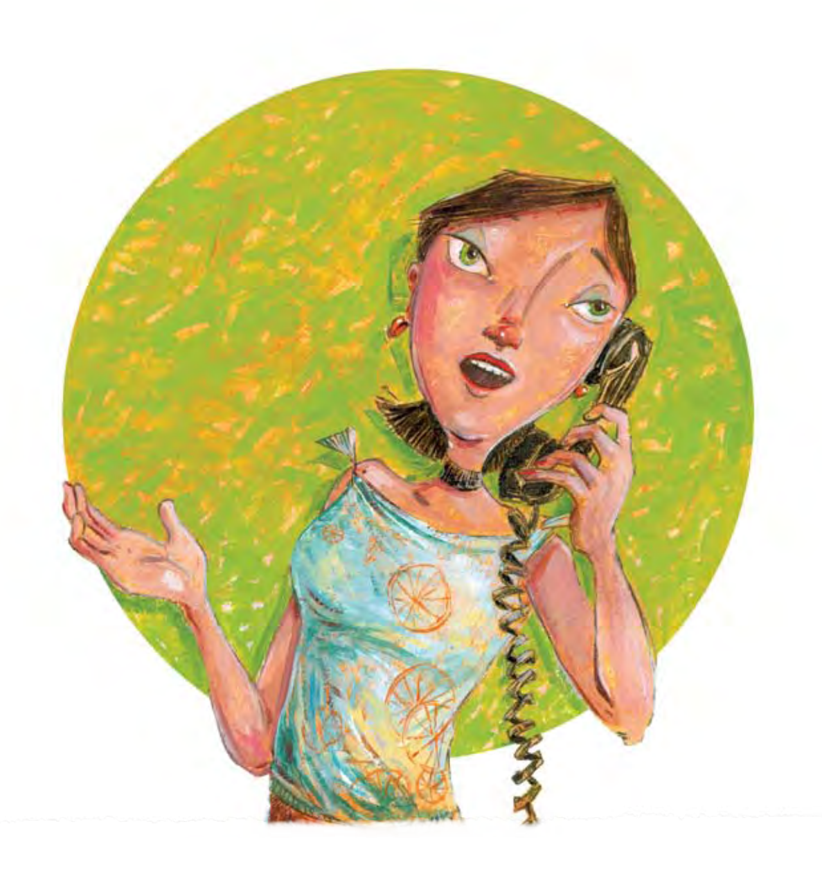
"I called them rather late. They only had one sitter left. I'm sure she will be great."