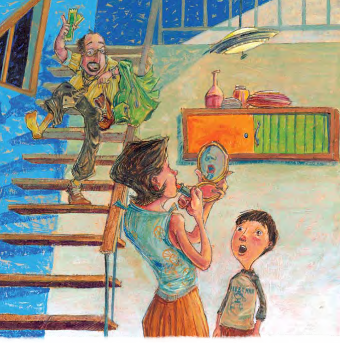
My parents have a date tonight. They're going to a show. I ask them, "Who will babysit?" Mom says she doesn't know. She says, "I called an agency."