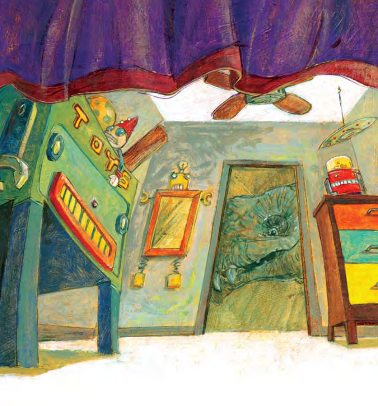
I run for cover to my room. I scream and race to hide. I sneak behind a chest of drawers. My fear is deep and wide. And soon I'm underneath my bed.