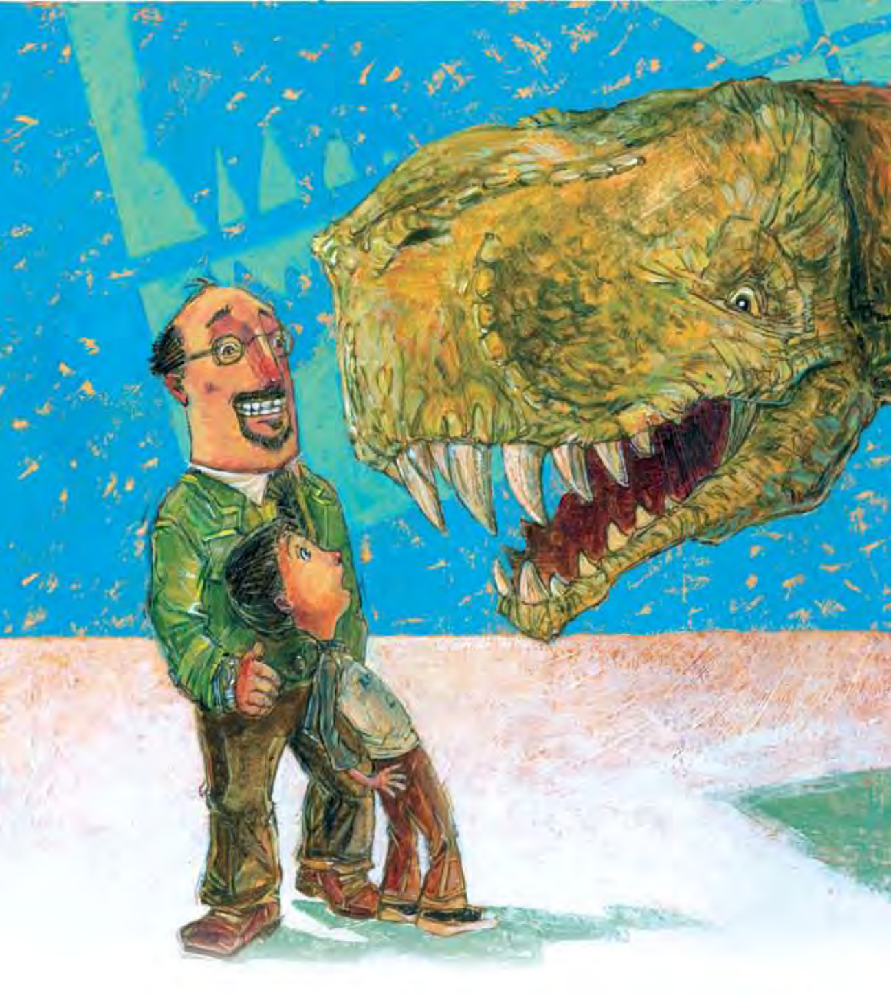
But Dad says, "Things will be just fine. I'm sure she is a jewel. We really have to say goodbye ." Then Sue begins to drool.