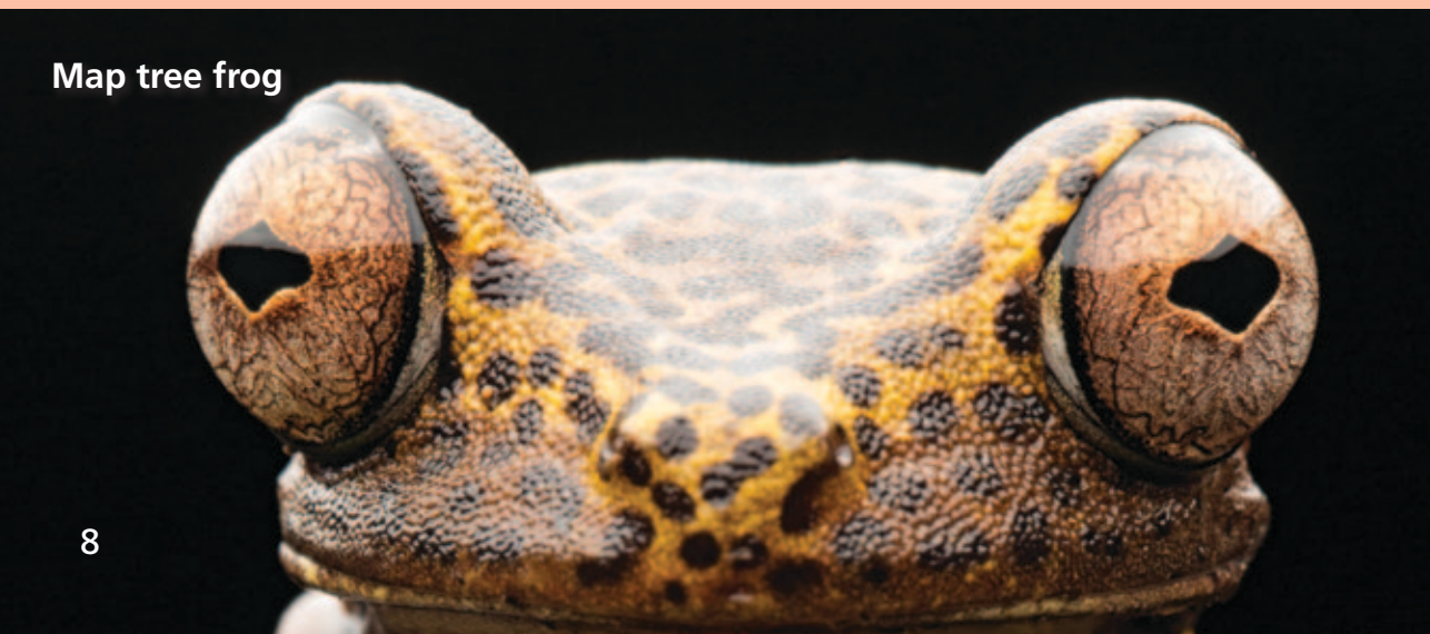
Map tree frog