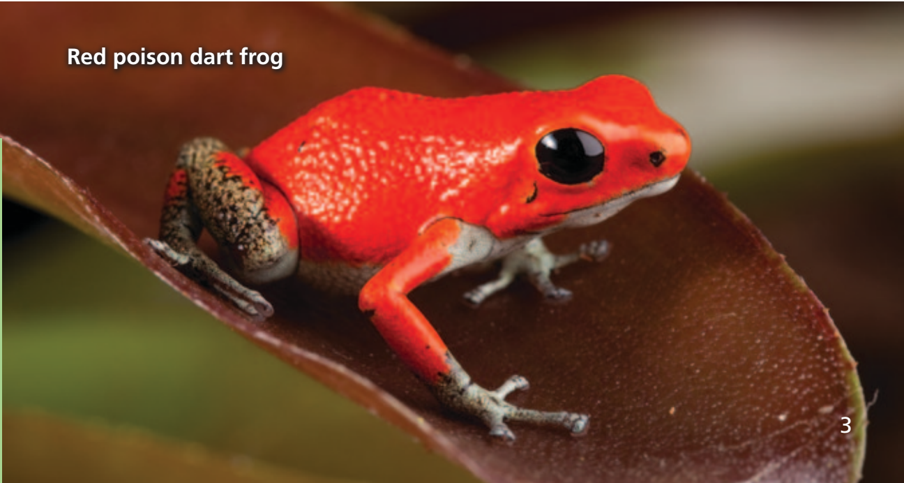
Red poison dart frog

🐸 Ribbit! Ribbit! Frogs are everywhere. They are amphibians (am-FIH-bee-inz), so their bodies are the same temperature as the air or water around them. They live on every continent except Antarctica. That continent is too cold!