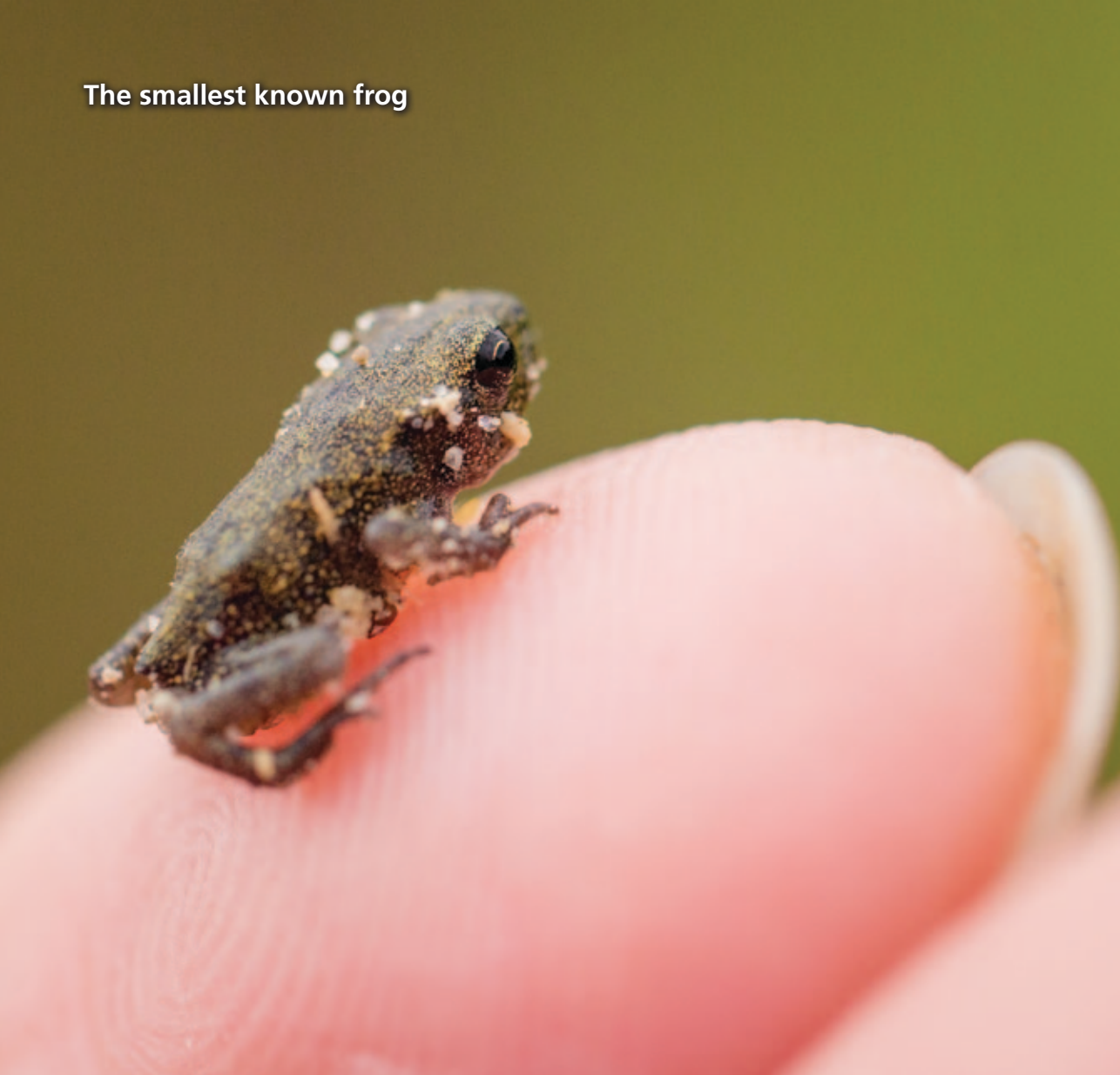
The smallest known frog