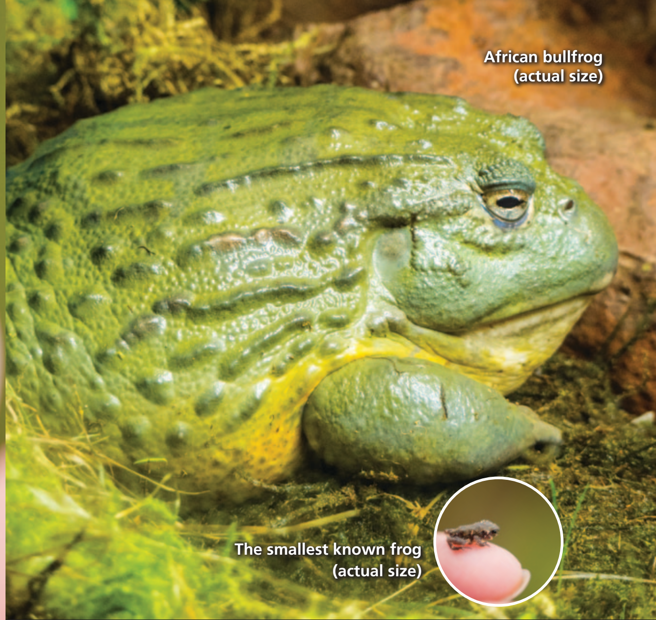
The smallest known frog (actual size)

👁️ Frogs come in many different colors, patterns, and sizes. The smallest known frog is less than a half inch long. The largest is the goliath frog, which can be as big as a small dog! Another very big frog is the African bullfrog.