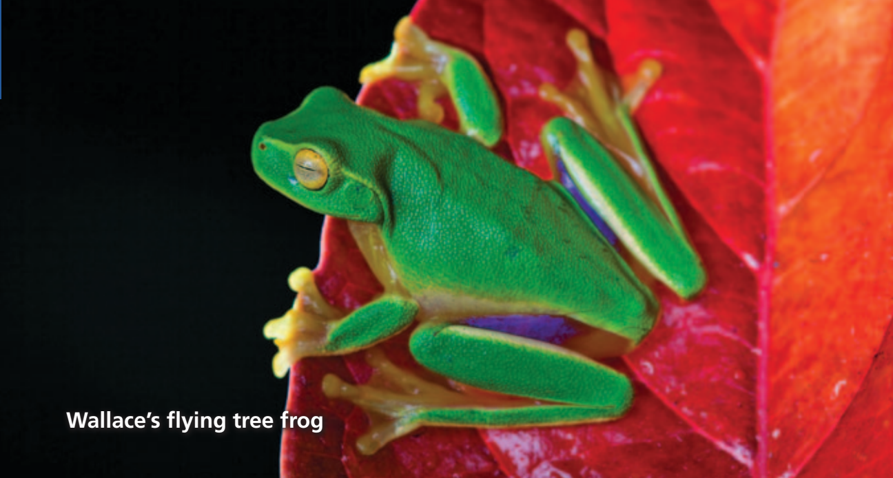
Wallace's flying tree frog