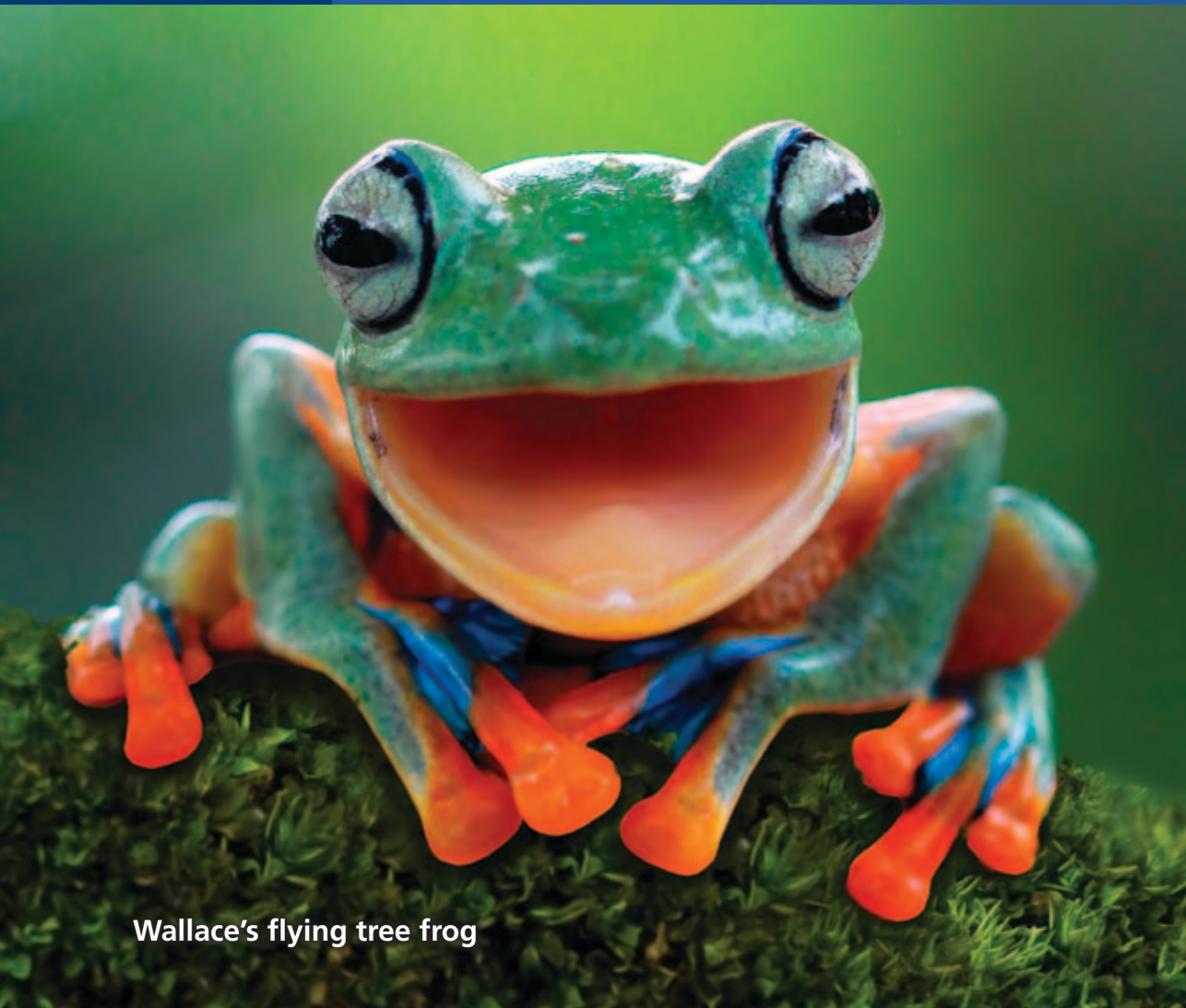
Wallace's flying tree frog