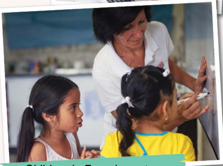
Children in Ecuador get information from a volunteer.

You can also find an organization that is making a change. Ask how you can help. What is needed most? How many people need help? How can you learn more about the problem?